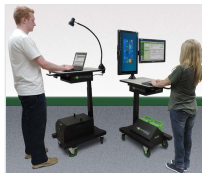
Ergonomic height range can accommodate any operator