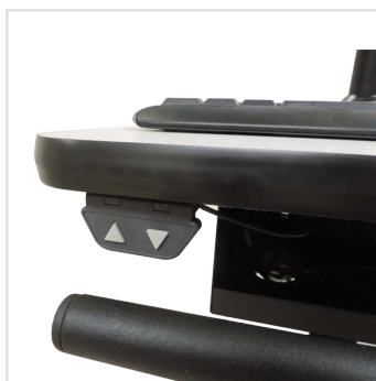
Adjust height in seconds with the touch of a button