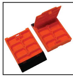
Cat # G1-CSC-100OE Description: Orange Chambered Cassette