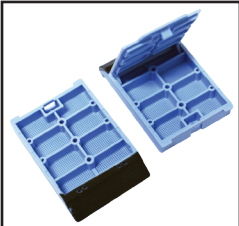
Cat # G1-CSC-100BE Description: Blue Chambered Cassette