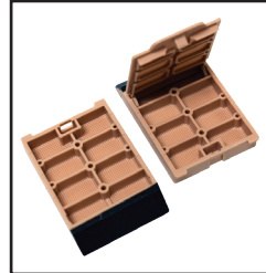
Cat # G1-CSC-100TN Description: Tan Chambered Cassette