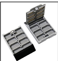
Cat # G1-CSC-100GY Description: Gray Chambered Cassette