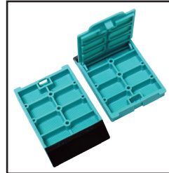
Cat # G1-CSC-100AA Description: Aqua Chambered Cassette