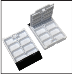
Cat # G1-CSC-100WE Description: White Chambered Cassette