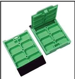
Cat # G1-CSC-100GN Description: Green Chambered Cassette