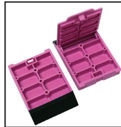
Cat # G1-CSC-100LC Description: Lilac Chambered Cassette