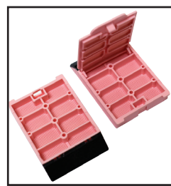
Cat # G1-CSC-100PK Description: Pink Chambered Cassette