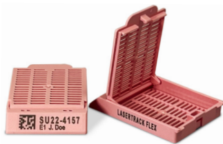
FLEX Slotted Cassettes (lids pre-attached)

The LaserTrack FLEX cassette printer is equipped with universal magazines that accept FLEX slotted cassettes, FLEX large hole cassettes, and frames for Sakura® Tissue-Tek® Paraform® sectionable cassettes. FLEX cassettes come in stacks of 20 that are taped with a special release liner for easy loading.