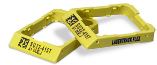
Sakura® Tissue-Tek® Paraform® Frames (formulated specifically for LaserTrack cassette printers, purchase from Sakura)