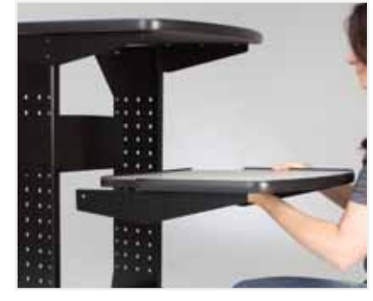
Optional, easily adjustable middle shelf