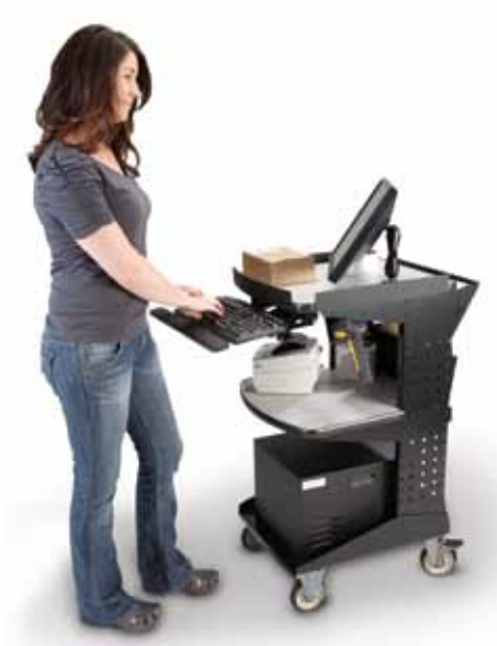
Powered version with optional accessories

A number of optional accessories are available and can be easily integrated in seconds for a highly versatile workstation.