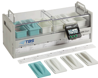
SS-6L 6-Position Manual Stain Rack