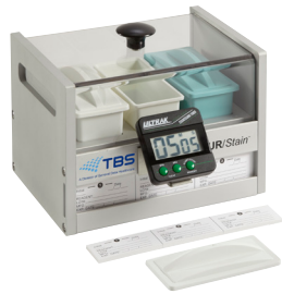
SS-3L 3-Position Manual Stain Rack